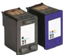
Ink & toner cartridges