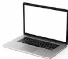
Personal laptops & phones